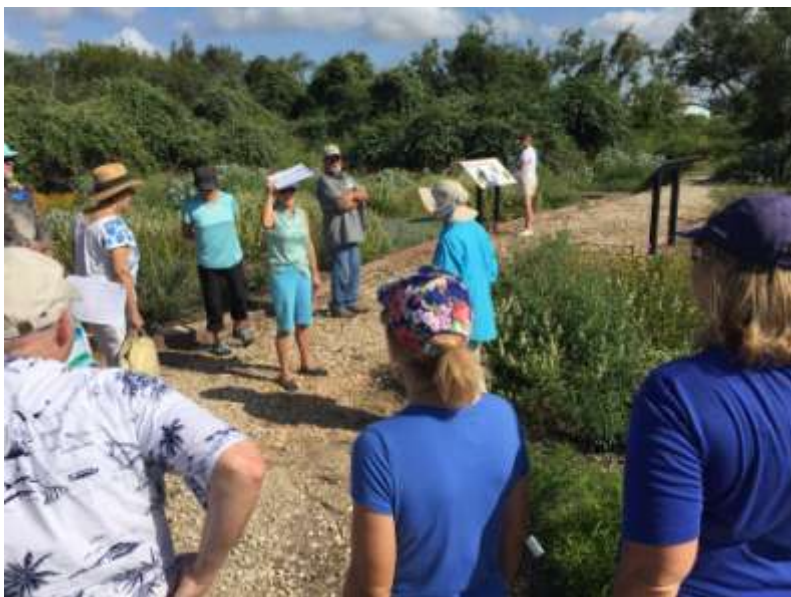
Visitors helped to celebrate Connie Hagar Day during a tour of the native plant garden at the Connie Hagar Cottage Sanctuary.